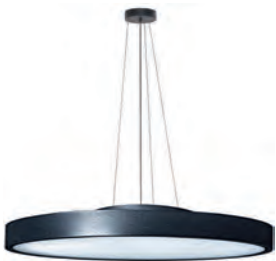
Standard pendant length: 1200mm Black