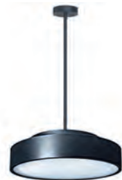
Standard pendant length: 1000mm Black