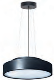
Standard pendant length: 1200mm Black