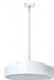
Standard pendant length: 1000mm White