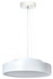
Standard pendant length: 1200mm White